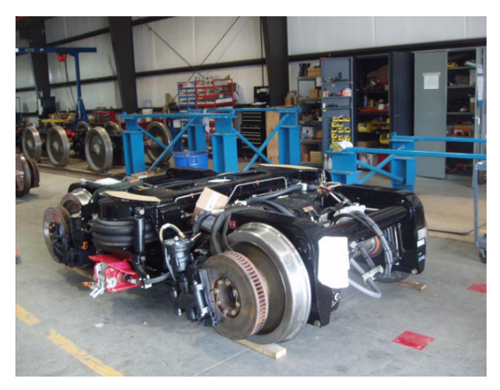
Rehabilitated Trucks Located at TTA Plant in Hornell, NY

Railcar Maintenance's representative states that he is not aware of a temporary fix that will address the cause of the failure. There has been no root cause of the failure identified and no final engineering disposition had been determined. Any temporary intervention will only address the issue at a symptomatic level. In addition, the Lord Chevrons may not be replaced for the Breda Chevrons in phase 3. It is his understanding that Alstom has documented their intentions to use the Lord Chevrons.