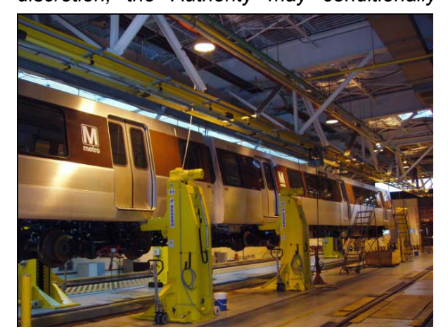
6K Railcar Undergoing Acceptance Testing at Greenbelt Facility

The timing of the acceptance of the railcars is also at issue. The Program Office is conditionally accepting cars that based on Special Provision 21.2.a which reads "At its discretion, the Authority may conditionally accept the cars when not completely