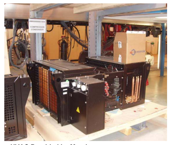
HVAC Provided by Merak

never worked as presented by Alstom and Merak.