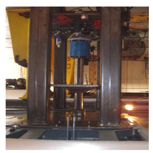
Boring Machine for New Center Pin at Hornell, NY Facility