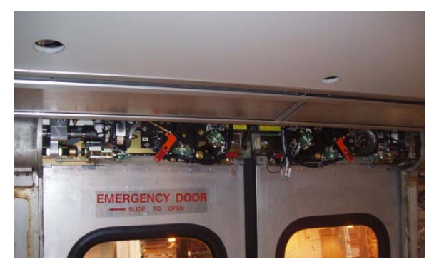
Door Components of Railcar 3129 on Production Line in Hornell. NY

be a costly endeavor and may force the Authority to purchase air compressors during a rehabilitation program, when WMATA has already spent $360 million to overhaul the railcars.