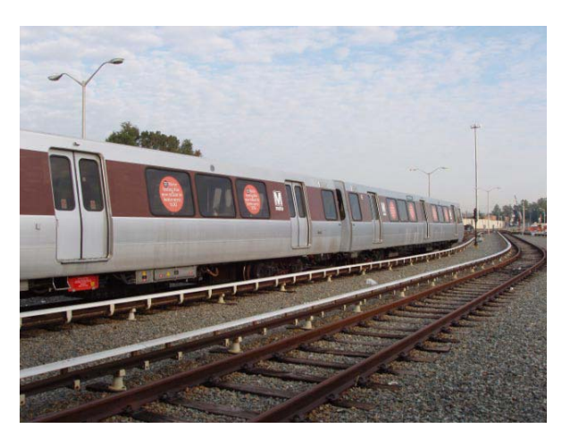
6K Railcars at Greenbelt Yard waiting to be tested in Revenue Service

An additional problem with acceptance of the railcars has become the availability and content of the Railcar History Books. In accordance with section 1.2.7 of the contract, "The Contractor shall provide a loose-leaf history book for each married pair of cars. (CDRL 110) ... Books shall be readily available for inspection by WMATA representatives."