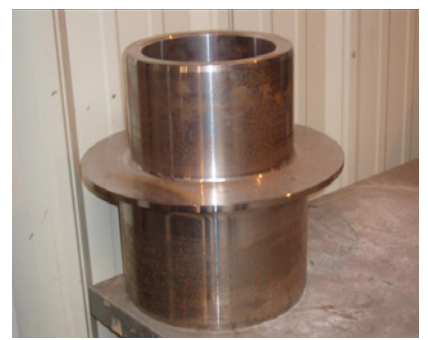
A center pin ready to be installed in a railcar in Hornell, NY