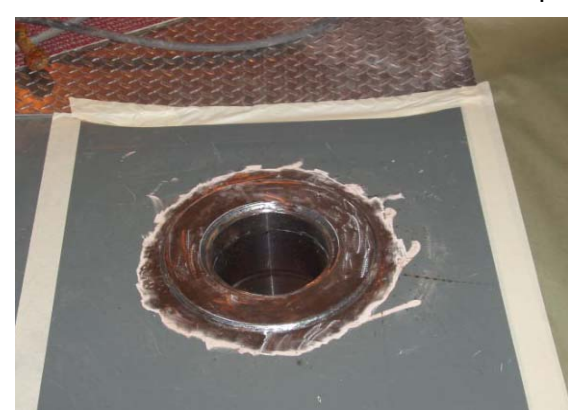
New Center Pin Installed in Railcar Ready for Painting of Railcar Floor

Railcar number 6083 was constructed using a new design in Barcelona to correct the issue and will not require repair upon delivery to the United States. This problem is considered by the Program Office to be resolved.