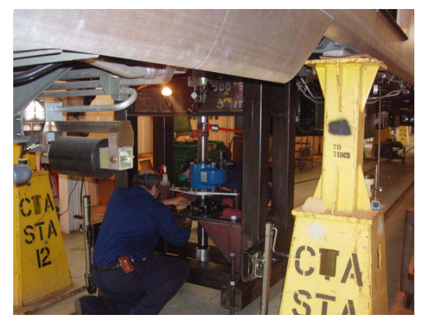
Worker Preparing Boring Machine for Installing New Center Pin at Hornell, NY Facility