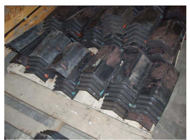
Lord Chevrons Located at TTA Plant in Hornell, NY

A temporary fix for the premature settling has been developed which will be implemented as part of the three phase recovery plan to complete all FMIs on the railcars already delivered. The temporary fix is intended to replace the B blocks with 1 inch blocks (FMI 219). The Lord Chevrons will be replaced with Breda Chevrons in phase 3 of the recovery plan once the lateral bumper clearance and uneven wheel wear issues are resolved. TTA stated in our discussions that it was their belief that the issue with the Chevrons is the captive which they considered tight at 4 mm.