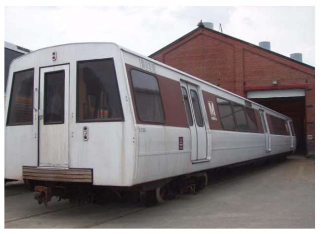
Inbound WMATA Railcar 3136 for Rehabilitation

There have been several issues with the 2000/3000 Series railcar including quality and supply/inventory of parts, reliability and onsite warranty and commissioning. To date the most significant parts issues include the Trucks remanufactured by TTA and the brakes supplied by WABCO. The Office of Railcar Maintenance reports that 95% of the problems with the rehabilitated 2000/3000 Series railcars is quality. They further stated that they recognized performance issues with the cars early in the program in 15 major sub-systems in the cars. In addition, the WMATA