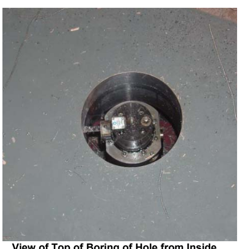
View of Top of Boring of Hole from Inside the Railcar

The Program Office is currently in the process of testing these railcars and achieving the Safety Certification to conditionally accept the railcars and put into revenue service. The remaining 10 cars at WMATA will be shipped back to Hornell, NY for repair. However, an interim fix was completed on six of the cars to allow testing upon