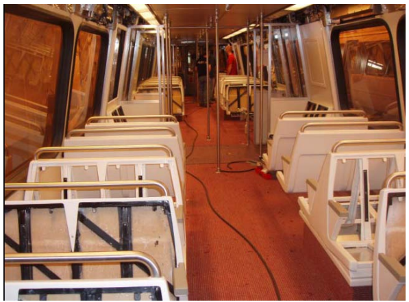
WMATA Railcar 3134 Being Rehabilitated in Hornell,