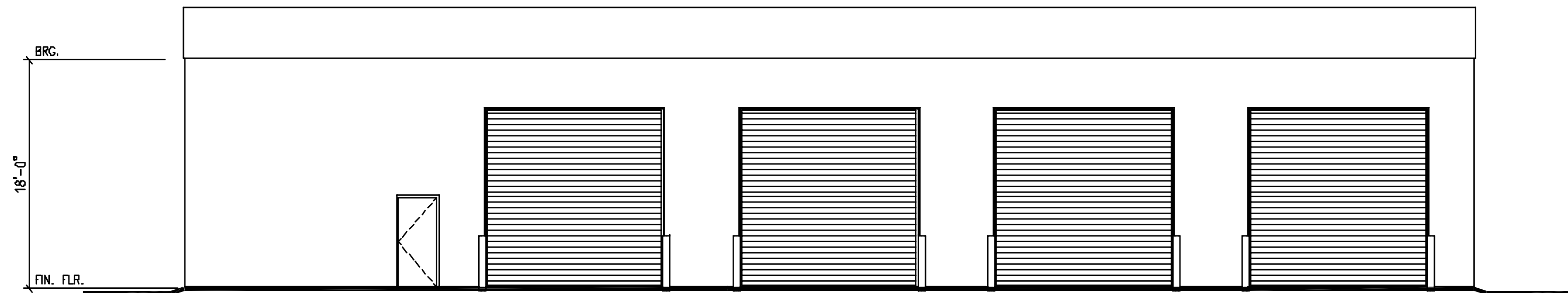
C SOUTH ELEVATION 1/8" = 1'-0"