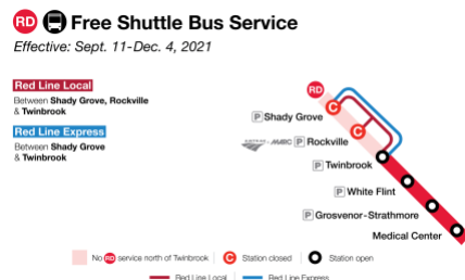
Photo: Rockville Shuttle Bus Map.png

Headline: Metro's Rockville Canopy Replacement Project begins September 11