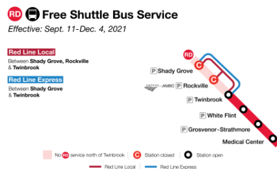
Photo: Rockville Shuttle Bus Map.png

Starting this Saturday, September 11-December 4, Shady Grove and Rockville stations will be closed, without rail service, for the Rockville Canopy Replacement Project. Construction crews will be working around the clock to demolish and replace the platform canopy at Rockville Station and install other customer experience improvements.