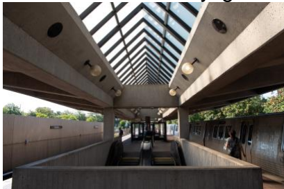
Photo: Rockville Skylight Before.jpg

Starting this Saturday, September 11-December 4, Shady Grove and Rockville stations will be closed, without rail service, for the Rockville Canopy Replacement Project. Construction crews will be working around the clock to demolish and replace the