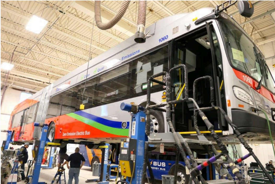
The rebuilt Northern Bus Garage will have the capacity to house up to 150 zero-emission buses.