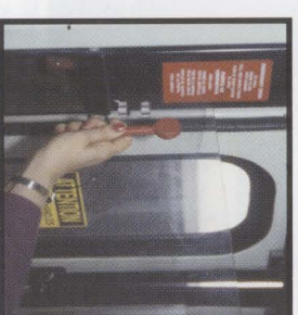
...to break the glass and access the manual door opener.

You can open the doors by disabling the mechanical opener. The release is next to the door.