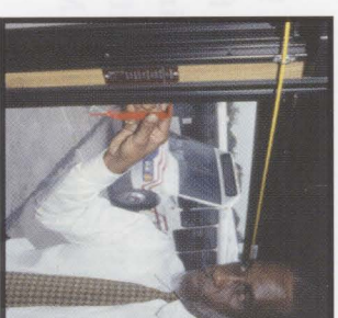
Use the red hammer...

You can recognize the emergency escape windows by their label and distinctive red handles. Next to the handle are simple instructions for opening the windows.