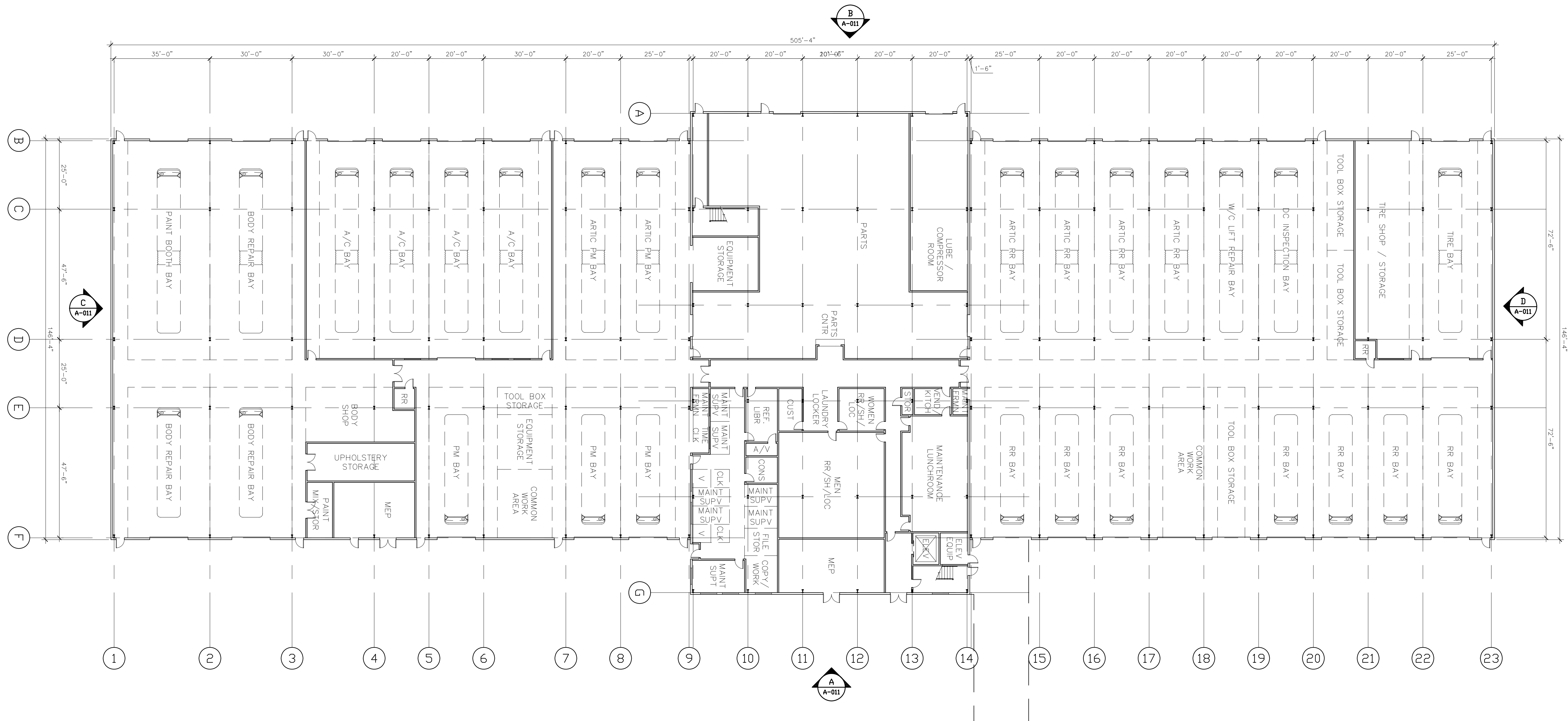
A FIRST FLOOR PLAN -- PHASE 2 1" = 20'-0"