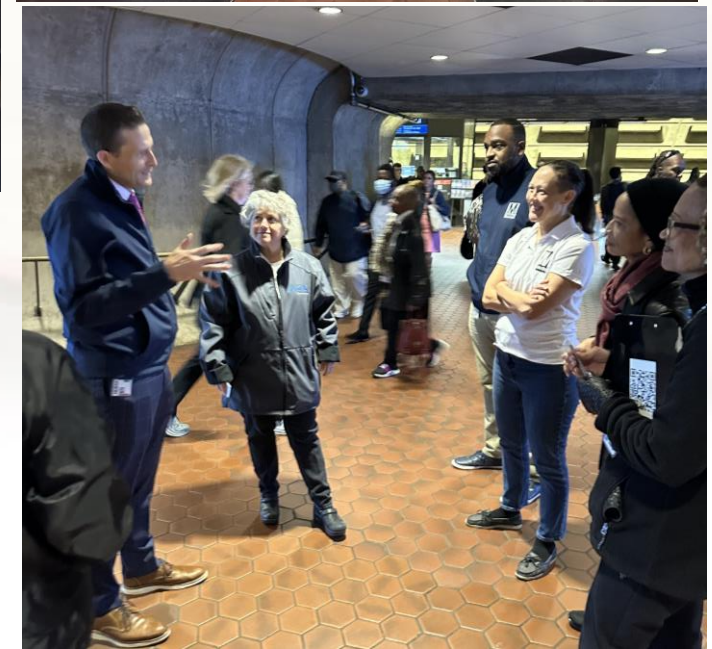
Meet the Team-Foggy