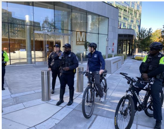
MTPD Bike Ride