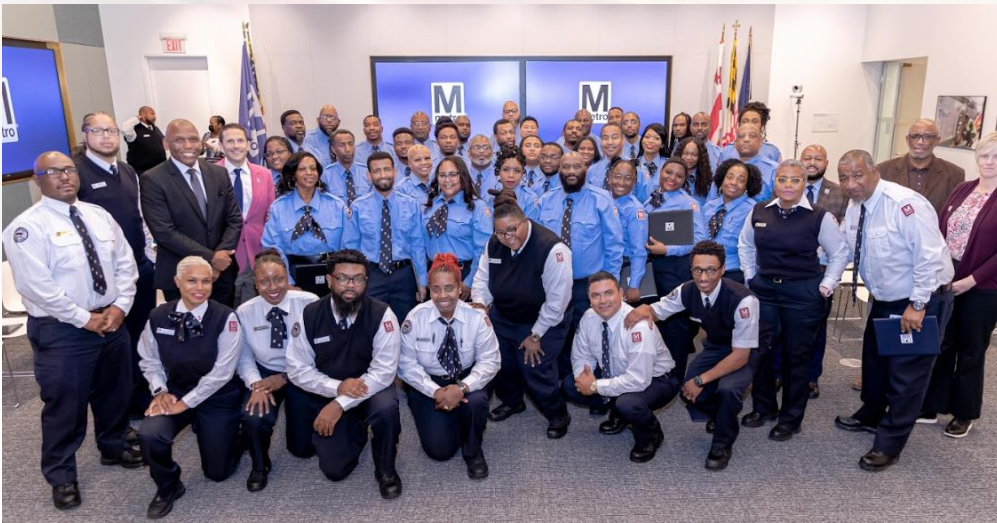
Bus Operator Graduation