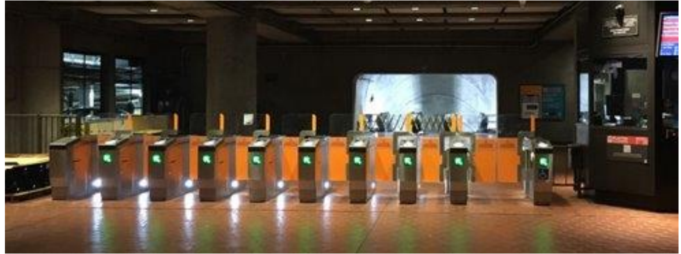
Wheaton Station Mezzanine with New Barrier Doors