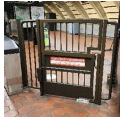
Increased Railing Height on Swing Door