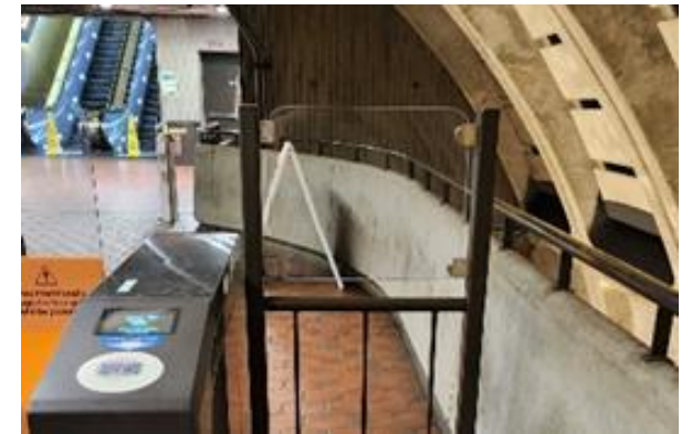
Increased Railing Height with Polycarbonate Clear Panel