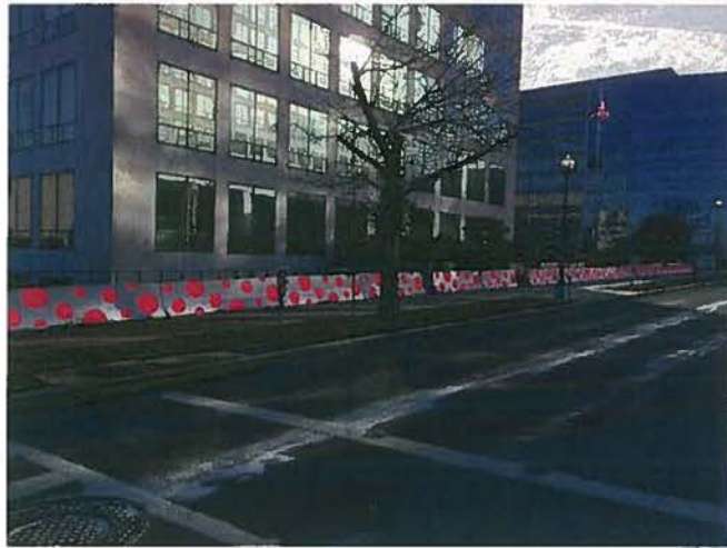
L'Enfant Plaza (Boston Properties)