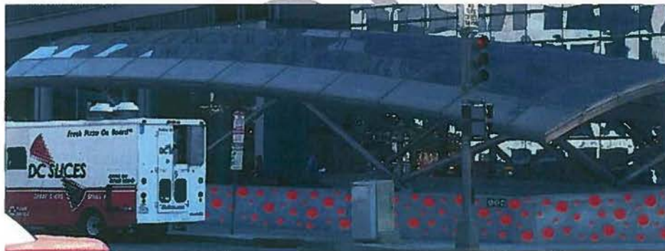
Yayoi Kusama Temporary Environmental Installation - February 23 – May 14, 2017 L'Enfant Station Entrance at 7 th St. SW and Maryland Ave. SW