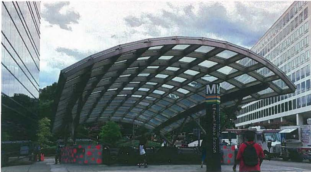
Design: Overview of Temporary Outdoor Installations along 7 th Street