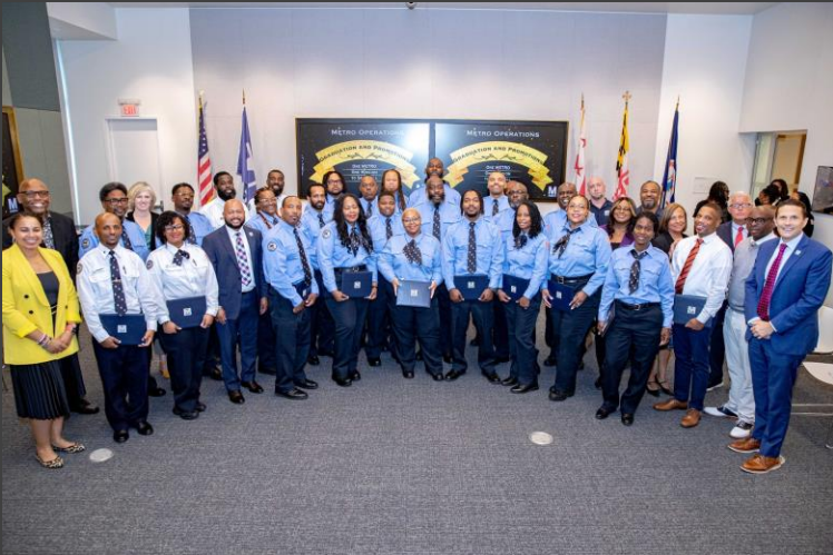
New Operators/Signal Techs Graduate