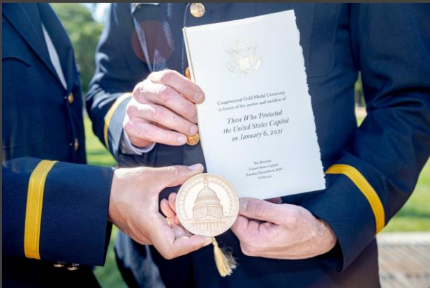
MTPD Congressional Gold Medal Acknowledgement