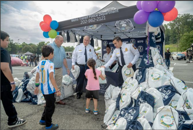
Metro Supports Back to School and Kids Ride Free