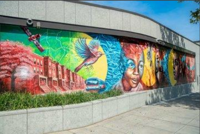
NASA/WMATA Unveils Joint Mural Project — Satellites of Hope