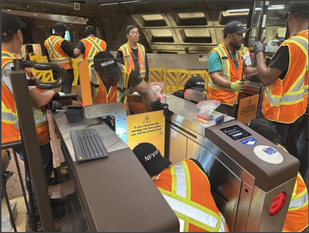
Fare Gate Modernization Complete