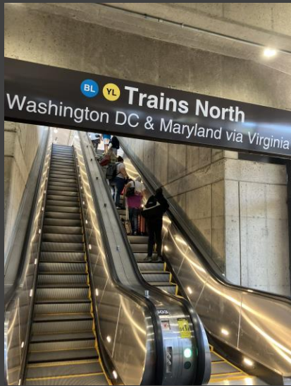
DCA Escalators Open 11 Days Ahead of Schedule