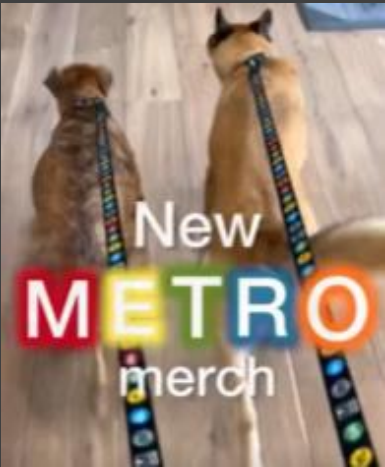
Metro Merch Gets a Boost from Furry Friends