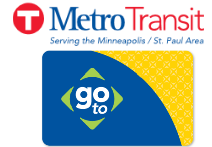
MetroTransit Transit Assistance Program