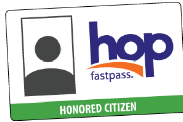
TriMet Hop Card