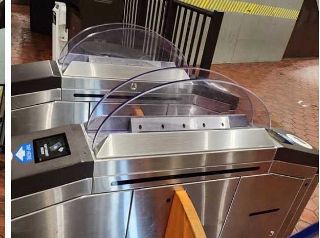
Anti-Vaulting Arches – Testing Began November 2022