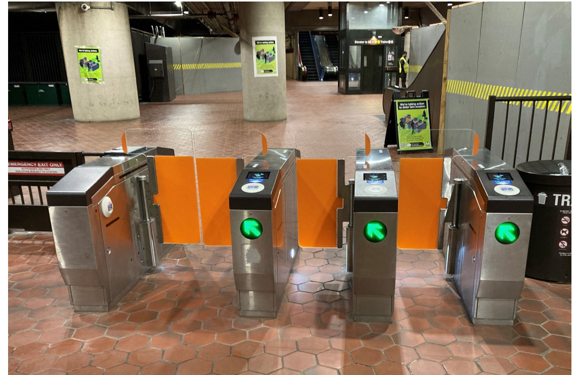
Retrofit Test 2: Single Door – Installations Underway