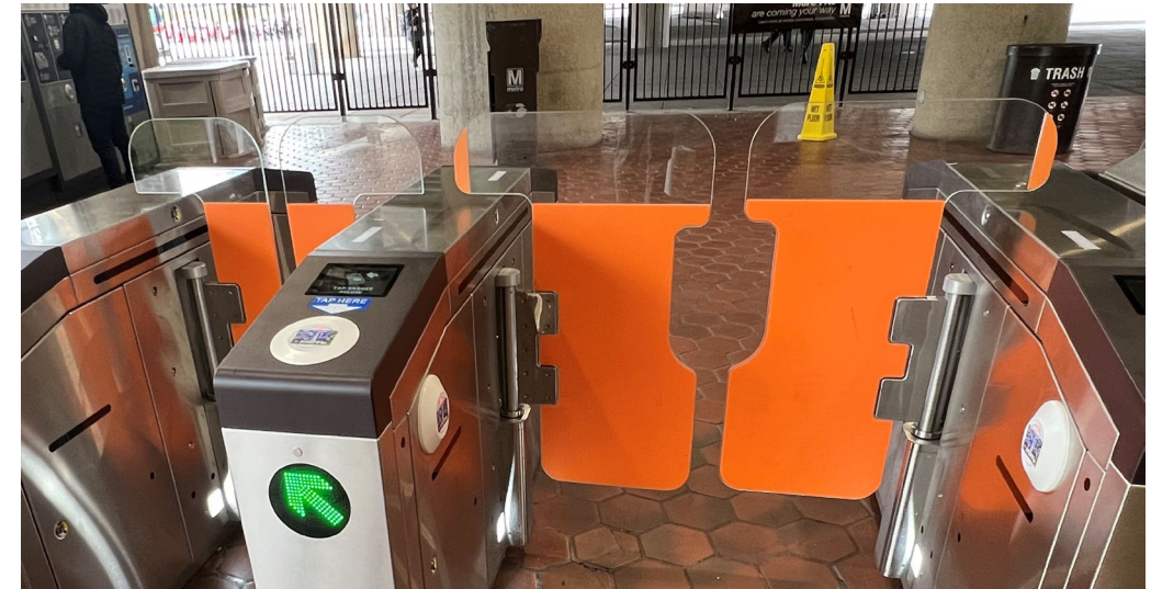
Retrofit Test 1: Two Swing Doors Testing Began late January