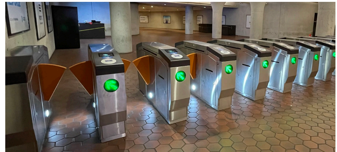
Modernized Gates - Gallery Place