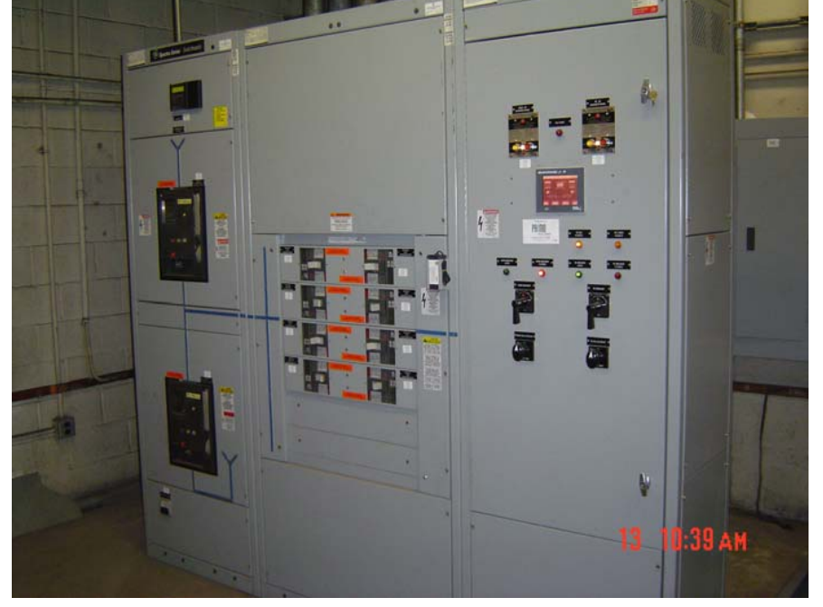
Pentagon City- Old AC Switchgear