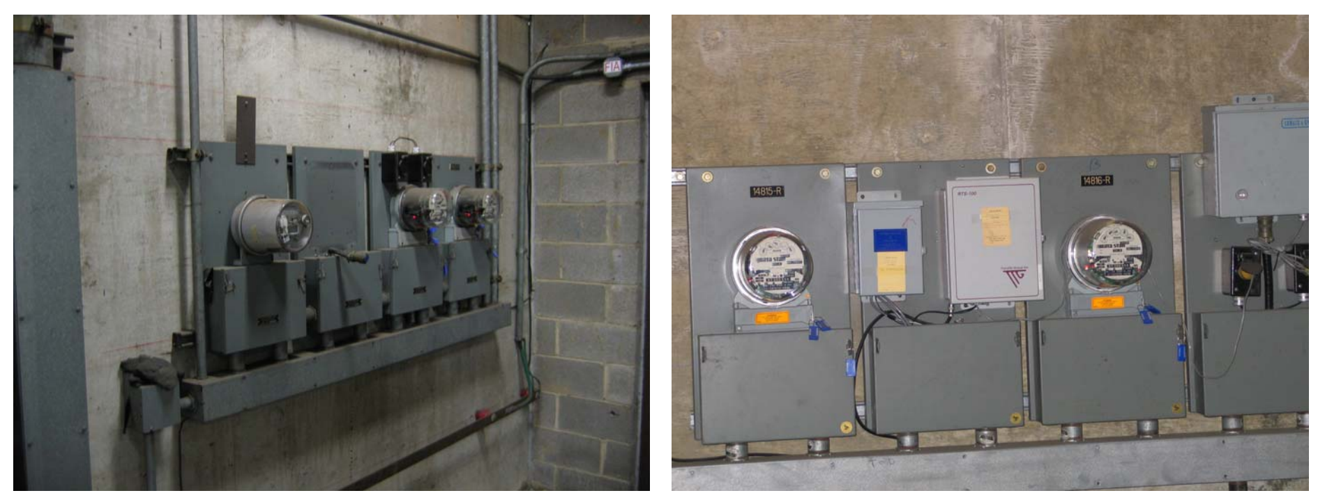
A06- Van Ness old metering system