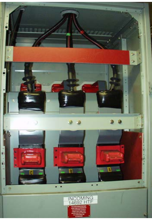
Capitol South - Current lead cable feeds