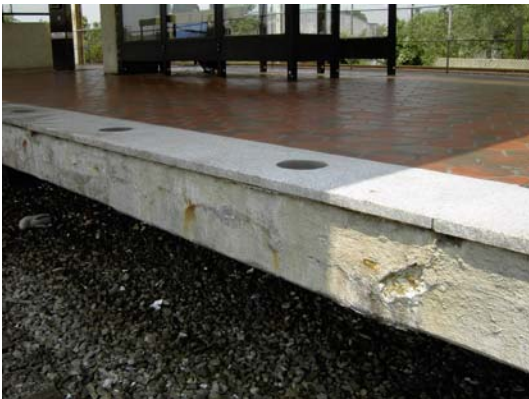
Out Bound Track