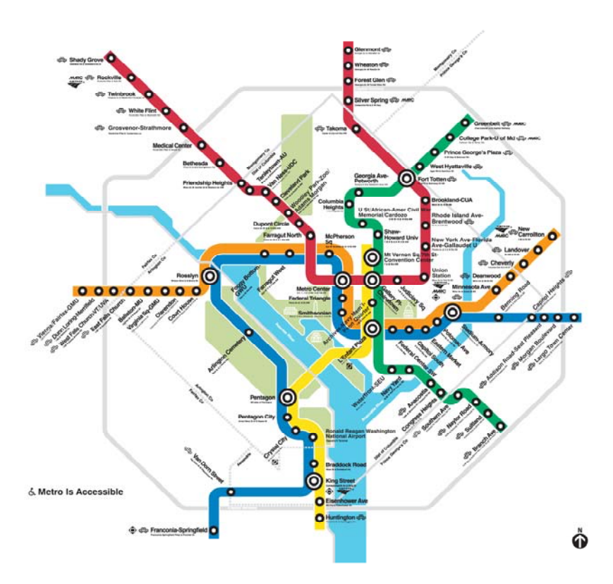
Signage Project Cost = $25M