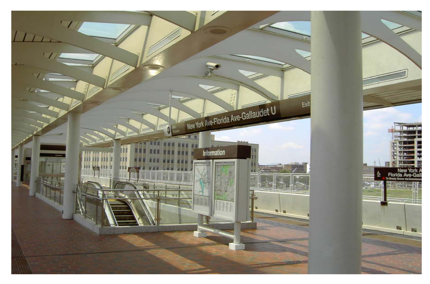
New York Ave-Florida Ave-Gallaudet U