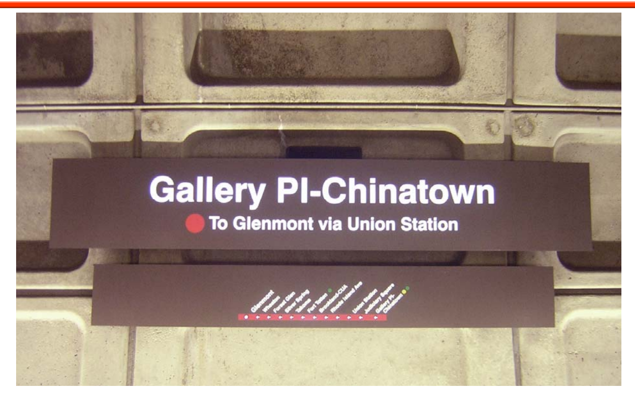
Station Ahead Lists & Station Name Signage

A pilot project to enhance station signage at Gallery Place - Chinatown was completed in 2004.