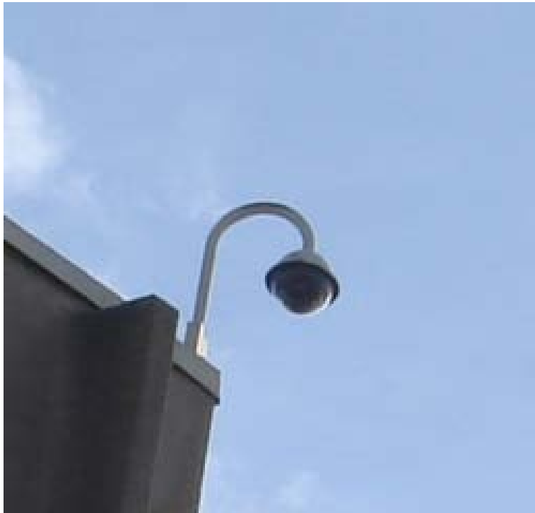
Exterior Surveillance Camera