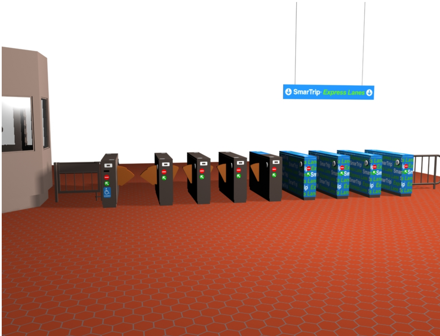
SmarTrip Only Aisles - Pilot Demonstration