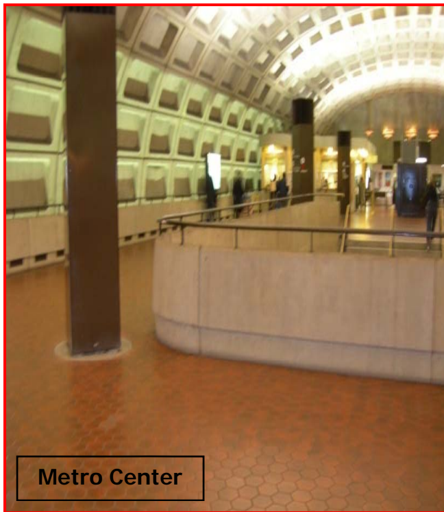
Paid area of mezzanine

Interior locations can accommodate built-in kiosks, removable cart structures, or vending machines