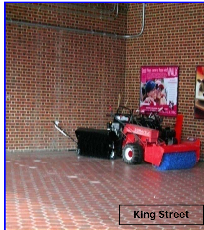
Free area of mezzanine