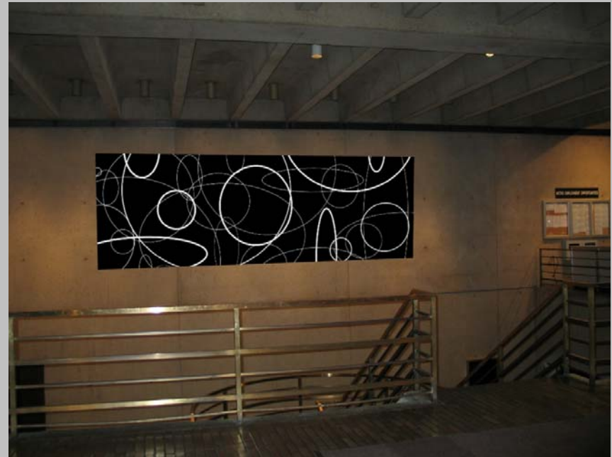
Anodized Aluminum Relief by Alex Mayer – Proposed Location of Panel One (two views)