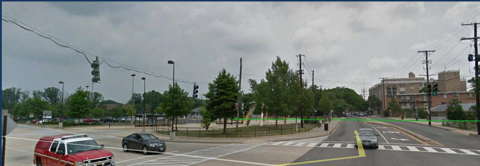
CURRENT CONGRESS HEIGHTS BUS LOOP (LOOKING NORTHEAST FROM ALABAMA AVE SE AND 13 th ST SE)

Approval of the exchange of property between Metro and the District of Columbia at the Congress Heights Metro Station