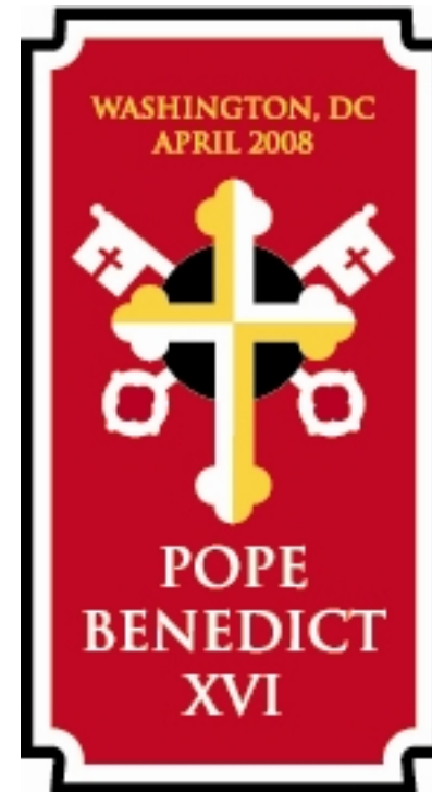
Pope Benedict XVI's first apostolic visit to the United States Thursday April 17, 2008