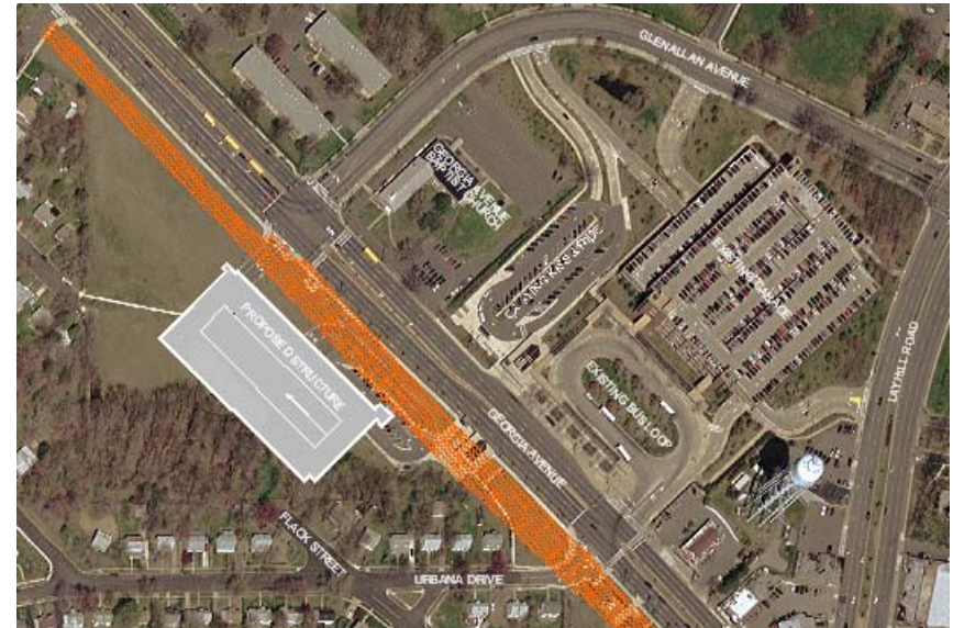
Glenmont Parking Structure April 2006