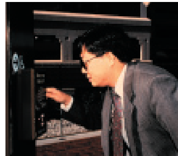
Emergency intercoms are in all stations.

If you see an unusual, unsafe or emergency situation at the platform, please report it to the station manager via the intercom mounted on the designated pylons.