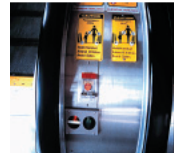
Know where to find emergency stop buttons.