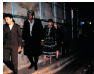
Stay on the raised safety walk.