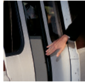
Never try to hold a train door open.