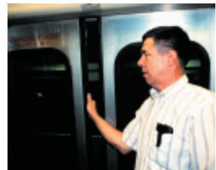
Slide door open.