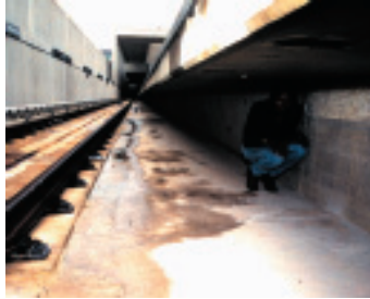
If a train is coming, roll under the platform edge.