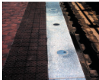
Stand behind the bumpy tile until the train stops.