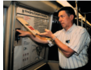
Pull red handle down.