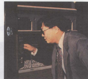
Emergency intercoms are in all stations.

If you see an unusual, unsafe or emergency situation at the platform, please report it to the station manager via the intercom mounted on the designated pylons.