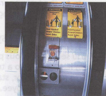
Know where to find emergency stop buttons.